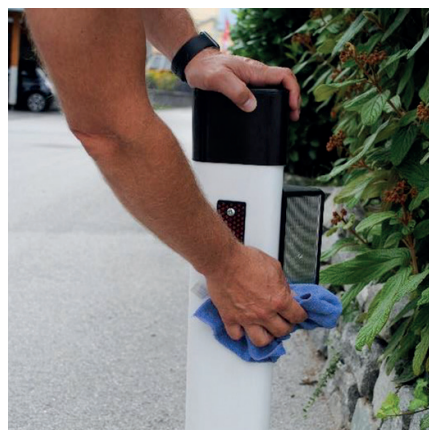
Cleaning and maintenance should be carried out twice a year

Exhaust gases, pollen and dust contaminate the wildlife warners and reduce their visual warning effect. Vegetation could cover reflector posts and thereby reduce the incoming light from the headlights and the reflection of the wildlife warner. Regular maintenance is therefore indispensable and important for road safety. Recommended cleaning interval: twice a year.